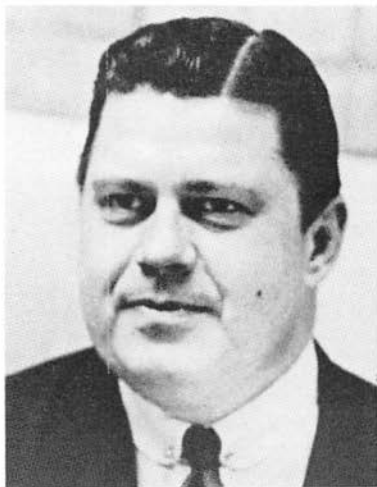
K. S. (Bud) ADAMS, JR.

In 1959, K. S. 'Bud' Adams, Jr. called a press conference to announce the formation of Houston's first major league professional team, the Houston Oilers. They would be a charter member of the brand new American Football League, and would start play in 1960.