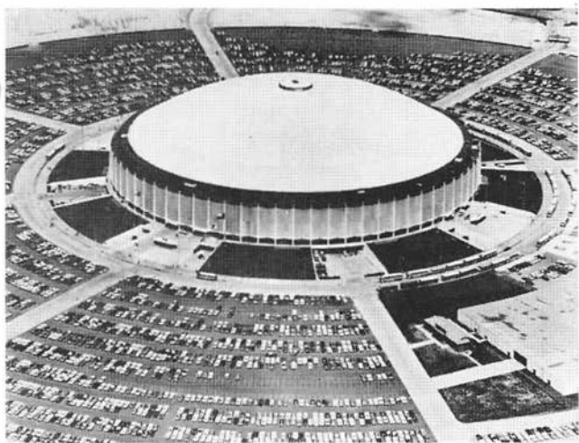
NEW HOME OF THE OILERS